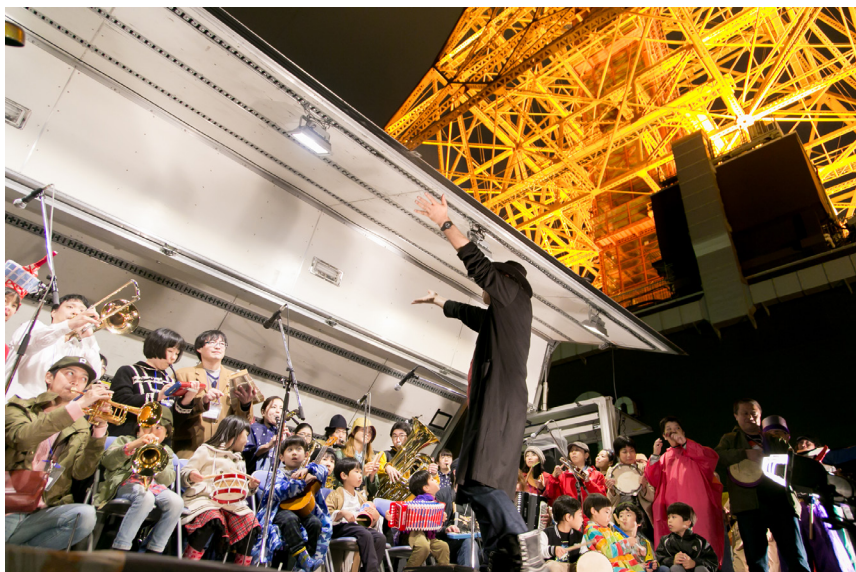
Otomo Yoshihide performing with workshop participants at Tokyo Tower in Ensembles Tokyo 2017