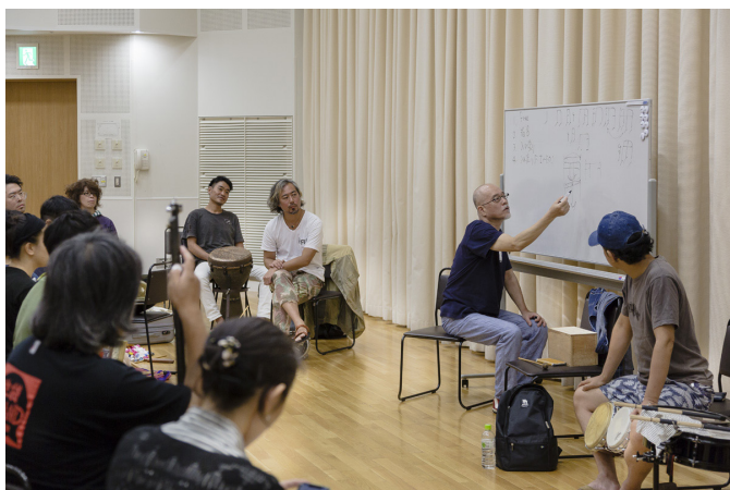
Yoshigaki's workshop in Ensembles Tokyo 2019

Even when improvising, some can only accept a kind of compositional approach, where things sound more musical and others find it more interesting when you can't be sure if it's music or not. John, and that whole New York scene, really influenced me, especially during the late 80s and 90s when people started to use samples and non-musical sounds in their music – that made me really think about the meaning of sounds and what it means to make music.