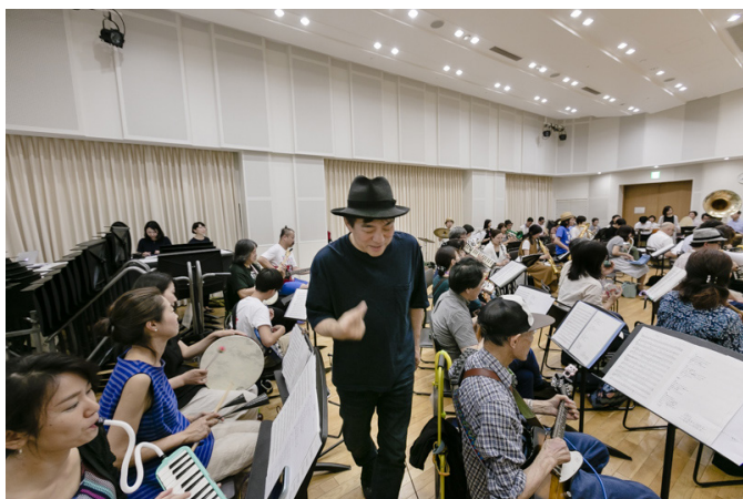
Otomo Yoshihide's workshop in Ensembles Tokyo 2019

Otomo: Like I was saying, the main thing is not to try to control the situation, right? It's best when you can catch on to what the participants are discovering on their own, and encourage them, like, "keep that going!" Without that capacity to be open to what others are doing and reflect on it – to see it and say "that's it!" -- you might miss some great stuff. So I don't bother