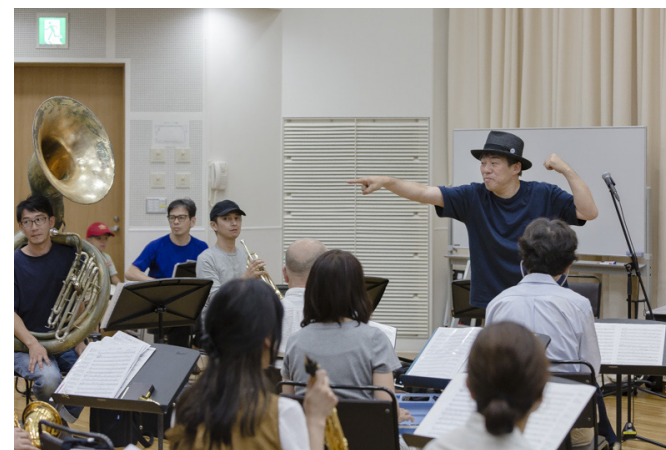
Otomo Yoshihide's workshop in Ensembles Tokyo 2019